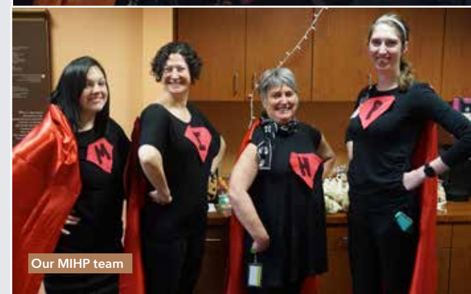
Our MIHP team