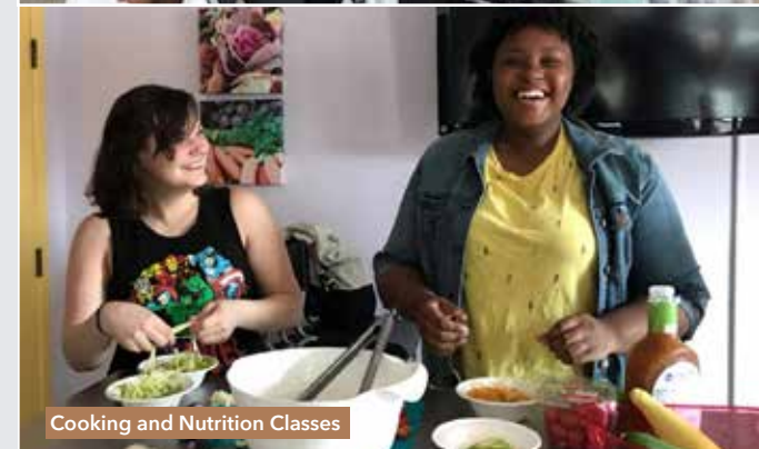
Cooking and Nutrition Classes