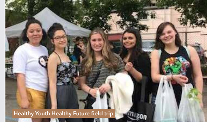
Healthy Youth Healthy Future field trip