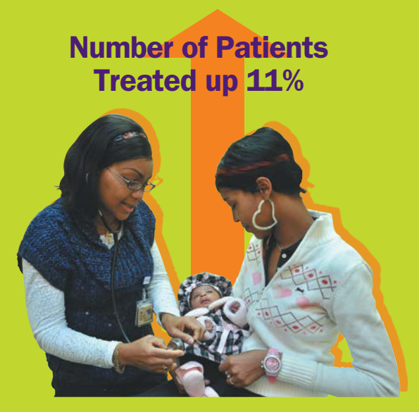
In 2012, 1,477 patients were treated at the Corner, an 11 percent increase from 2011.

In the past year, more than 1,400 patients received care at the Corner. They made 5,700 visits to the Corner, receiving 9,500 services including preventive care and immunizations, acute care for common illnesses, treatment and management for chronic illnesses, reproductive health care, prenatal care, testing and treatment for sexually transmitted infections, and health education. By providing same day appointments and care coordination, the Corner helps patients avoid unnecessary trips to emergency rooms.