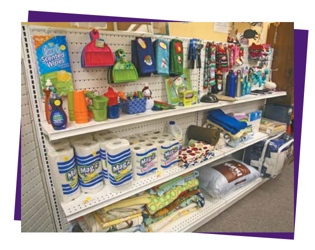
Household items in the Corner Store.